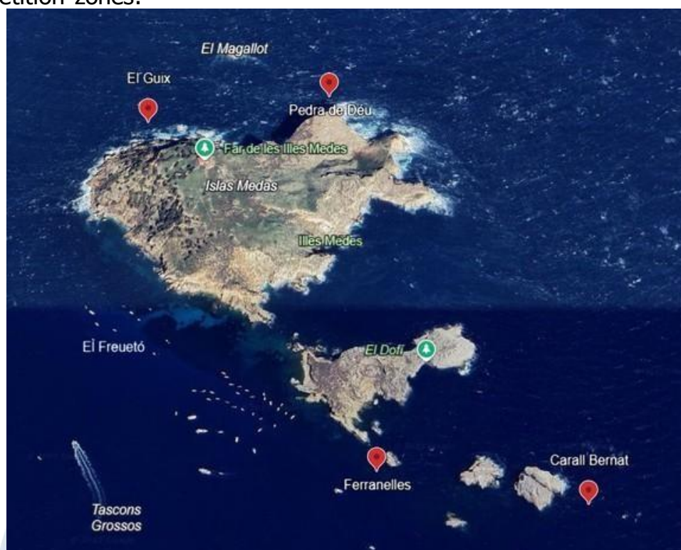
Diving spots in the Medes Island